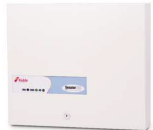
Senator 200 minimum display