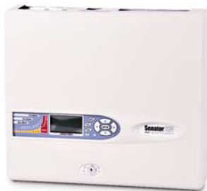
Senator 200 detector with command module