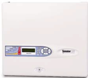
Senator 200 detector