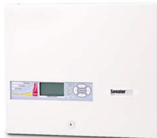
Senator 200 detector with command module - steel enclosure