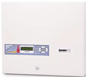
Senator 200 detector - steel enclosure